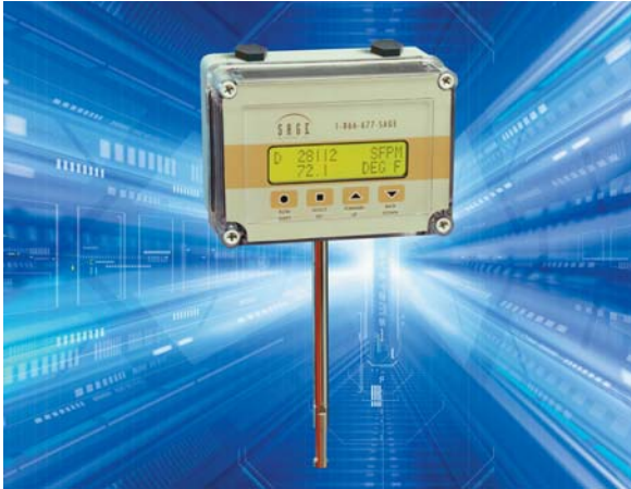
SIG —Integral General Purpose