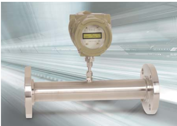
SIE —Integral Explosion Proof