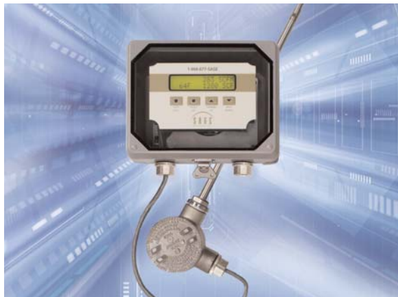
SRG —Remote General Purpose