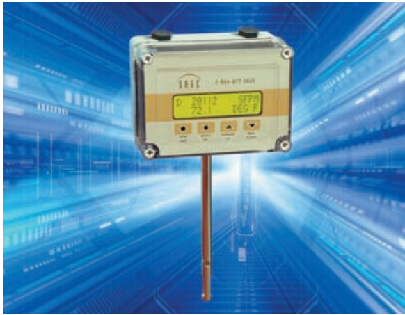
SI6—Integral General Purpose