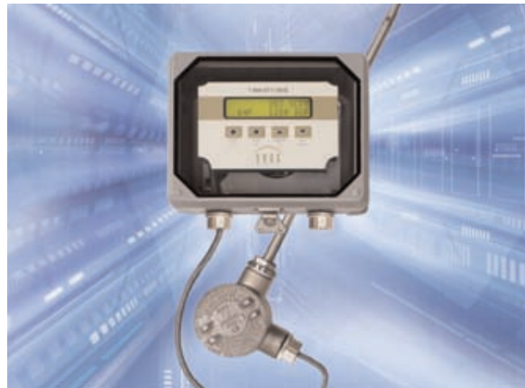
SRG—Remote General Purpose