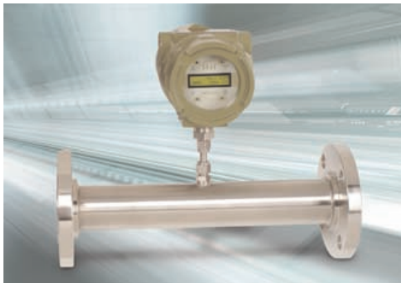
SIE—Integral Explosion Proof